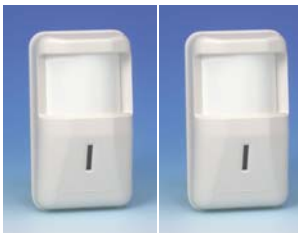
Motion Detectors [2]