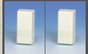
Door/Window Sensors [2]