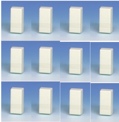
Door/Window Sensors [12]