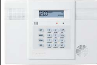
Honeywell Console Shown