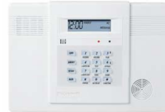
Honeywell Console Shown