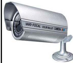
Camera installed in same room with VCR