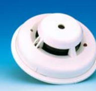
Smoke Detectors [2]