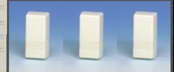
Door/Window Sensors [3]