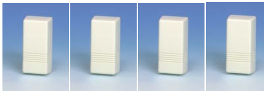
Door/Window Sensors [4]