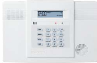
Honeywell Console Shown